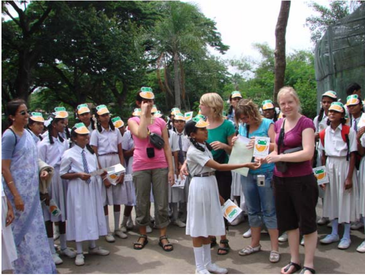
Mysore Zoo, 2008)

National Global programmes converted to AArk : Wildlife Week, (Oct 07), Indian Animal Welfare Fortnightly (Jan 08), World Environment day (June 08) and other individual function days were a platform for various-sized programs, including the biggest conservation education event in India again, Wildlife Week Oct 08. Thanks to Sea World Conservation Fund we made hundreds of AArk caps to attract attention, increase awareness and go along with AArk literature. Thanks to Sea World programme we will be able to cover more of South Asia with more of our attractive learning materials in the rest of YOTF 08 and beyond. (Photo, Students programme entertain and educate foreign visitors, Photo