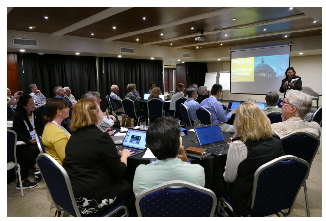
Meeting participants listen to a presentation.