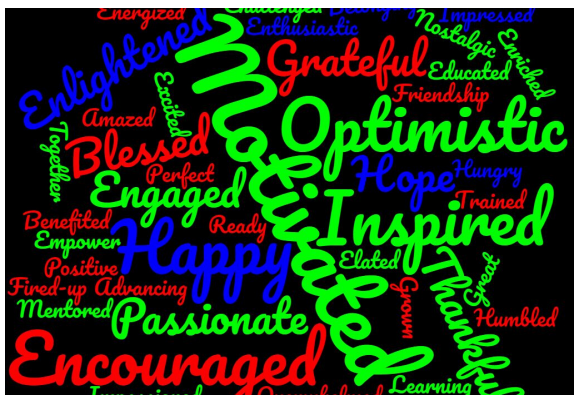
Attendees feelings captured in a word cloud at the end of the meeting.

They worked in small groups focusing on issues including aligning CPSG-led and government conservation plans; overcoming political and governmental obstacles faced by zoo-based programs; inspiring leaders to unite behind our shared responsibility to save species; and working beyond the professional conservation community to empower new voices to effectively drive change.