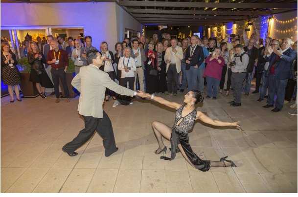
Tango dancers at the WAZA opening ceremony.

development of this online resource. The group was extremely productive over the two-hour period available. A combination of whole-group brainstorms and small group work addressed these questions, producing a comprehensive list of potential audiences, specific needs for each of those stakeholders and inputs on delivery strategies and content for the course. In addition, a number of people agreed to join the collaboration team.