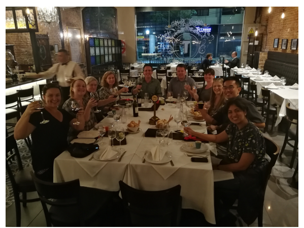
Mentors and mentees gather for dinner.