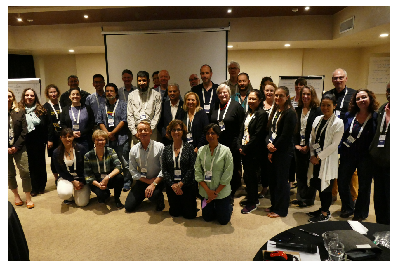
The aligning plans working group