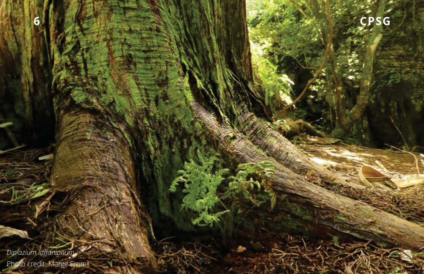
Diplazium laffanianum