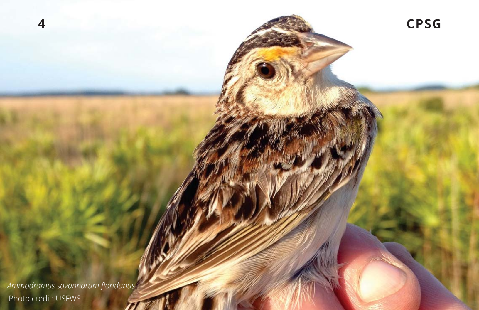
Ammodramus savannarum floridanus